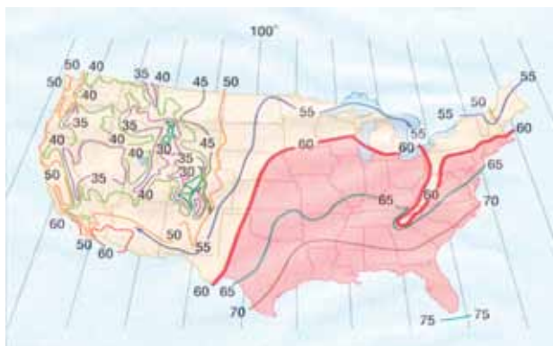
Figure 2 Mean dew-point temperature isoclines for July and August (1946–1965) from the Climatic Atlas of United States.

With mold growth, occupants may begin to report odors, and some may complain of a variety of health problems. The most common health effects associated with mold exposure include allergic reactions. Symptoms include sneezing, runny nose, skin and eye irritation, coughing, congestion, and aggravation of asthma symptoms. The types and severity of symptoms depend, in part, on the types of mold present, the extent of an individual's exposure, the ages of the individuals, and their existing sensitivities or allergies. Therefore, for people in general, it is not possible to determine safe or unsafe levels for airborne concentrations of mold or mold spores.