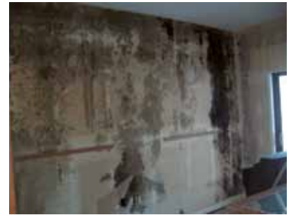
Figure 1 Appearance of mold on drywall.

Mold is a natural part of the environment. Molds are forms of fungi found year round both indoors and outdoors. Mold growth is encouraged by warm and humid conditions, although it can grow during cold weather. There are thousands of specimens of mold and they can be any color. Most fungi, including molds, produce microscopic (2 to 10 \mu\text{m} ) reproductive cells called spores. These spores typically disperse through the air continually and settle on all building surfaces, where they can remain dormant for years. Given the right circumstances, they may begin growing and digesting whatever they are growing on in order to survive. There is no feasible or cost-effective method to completely eliminate fungal spores from the indoor environment.