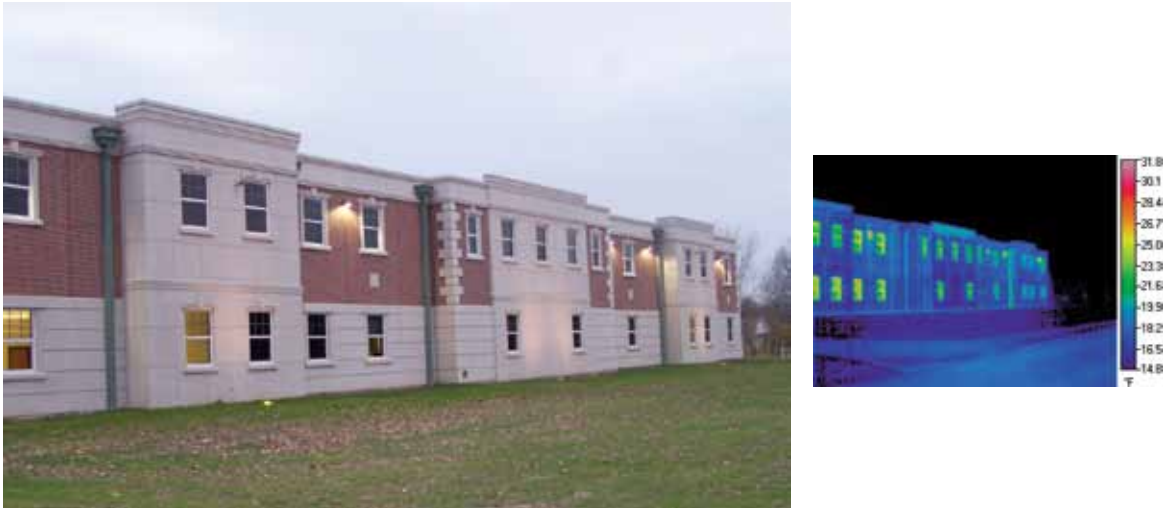
Figure 2 Thermographs of a high performance precast building show that the exterior concrete surfaces have a nearly uniform temperature, verifying the lack of thermal bridges or air leaks. Only the windows and parapet areas show higher local temperatures.

panels can be preglazed at the plant or window installation can be immediately completed in the field resulting in quick enclosure of the shell in any weather condition. Faster completion reduces interim financing and construction management costs, results in earlier cash flows, and produces other economic benefits. Loadbearing architectural precast concrete walls support floor loads and simultaneously form the exterior finish of the building, eliminating the redundancy between exterior finish and structural components. This ultimately lowers the building's long-term overall cost and can make the use of precast concrete more economical. Cost savings are greatest for low to mid-rise structures with a large ratio of wall-to-floor area.