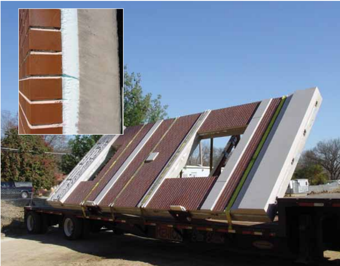
Figure 1 Insulated sandwich wall panel with continuous edge to edge insulation.

with no or minimal thermal bridges maintains the R-values for continuous insulation as defined by ASHRAE 90.1-2010 1 , thereby lowering energy costs ( Fig. 1 ). In some climates, increasing wall and roof R-values by as little as 5 can reduce energy costs by 5 to 20%. 2 High performance precast concrete sandwich wall panels commonly have steady state R-values ranging from 12 to 20 hr ft 2 °F/Btu. The thickness of the insulation is determined by the thermal characteristics of the insulating material and the thermal loads on the structure.