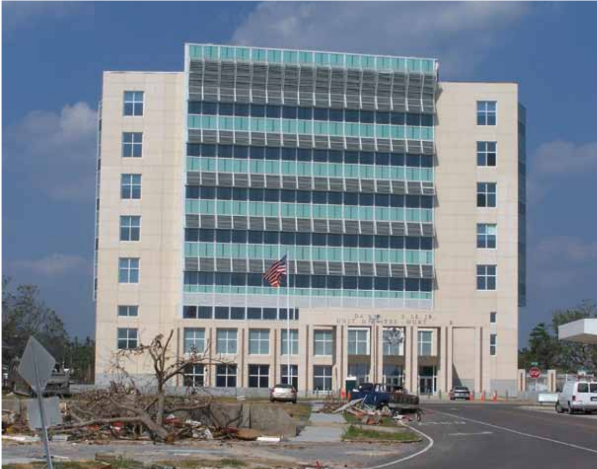
Figure 5 Insulated sandwich wall panels provided excellent protection from hurricane force winds and flying debris.

the danger of toxic fumes caused by burning of cellular plastics is practically eliminated when the plastics are completely encased within concrete sandwich panels.