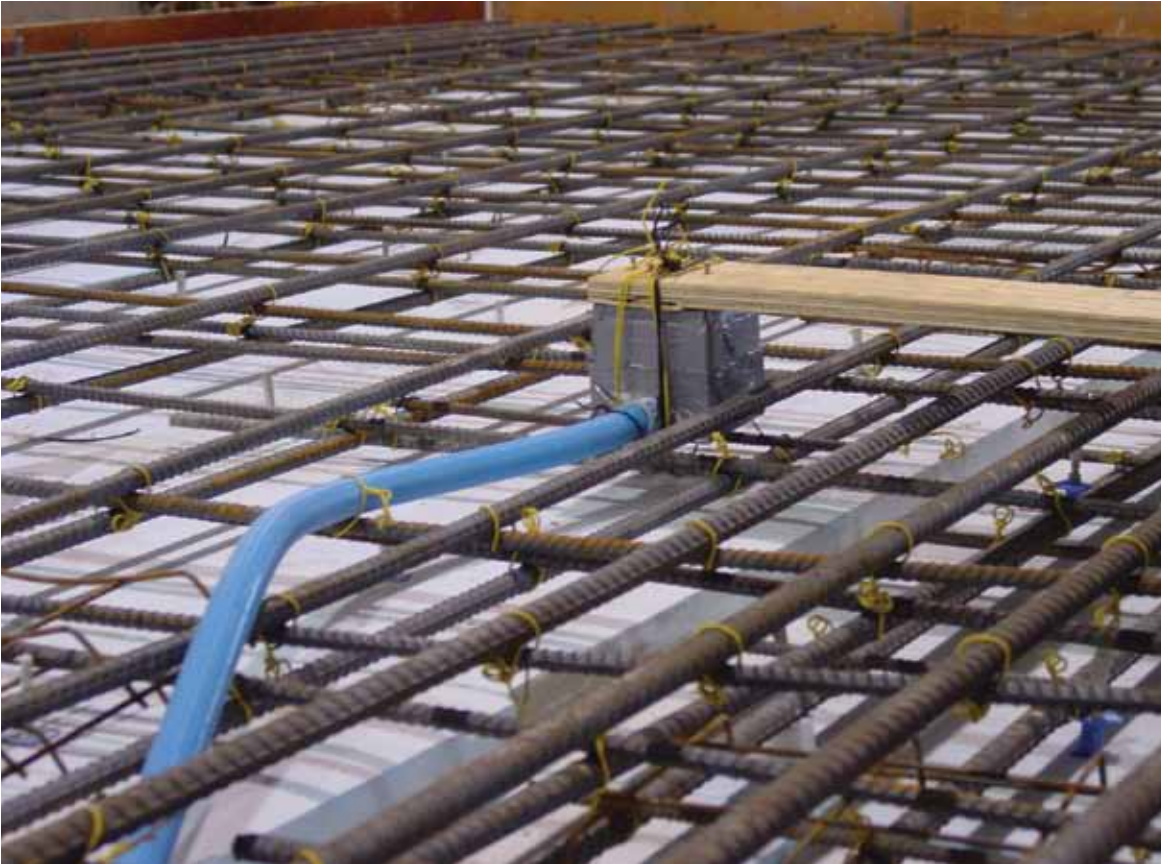
Figure 4 Electrical conduit and outlet box being installed in insulated sandwich wall panel.

a multitude of perimeter columns. Large open floor plates can then be accommodated quite easily offering great flexibility in marketing the space.