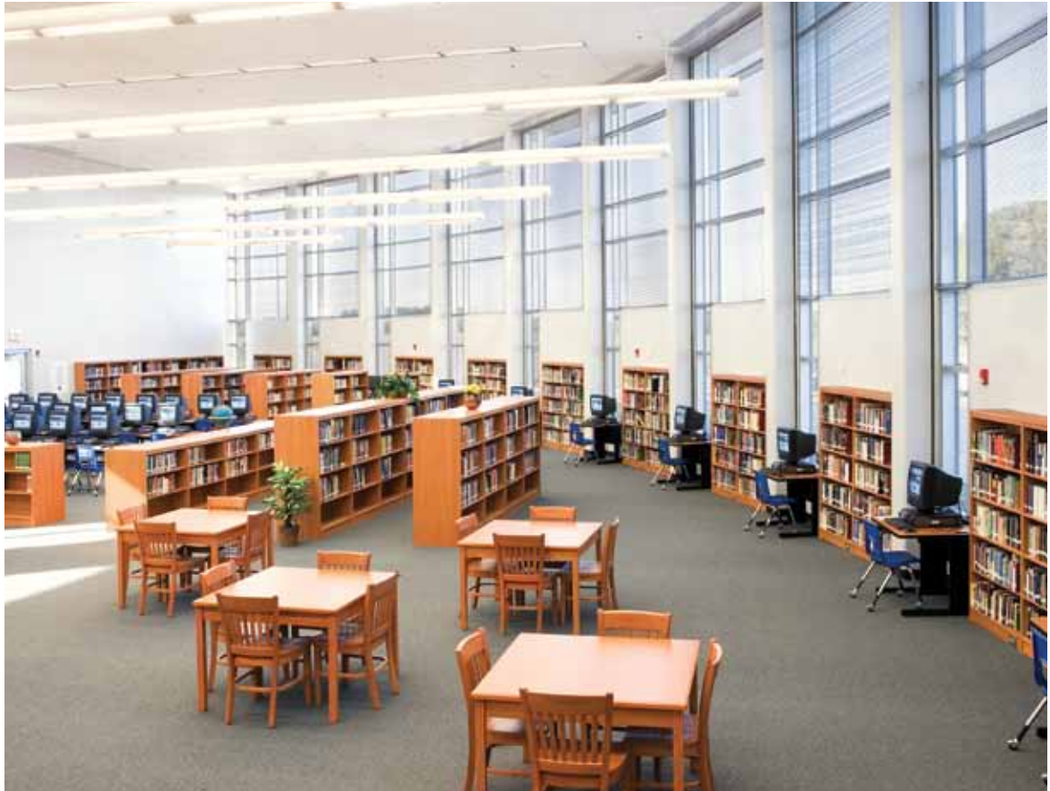
Figure 3 The insulated sandwich wall panels of the high school media center allowed the interior finish to be exposed painted precast concrete.

separate insulating and finish subcontractors. Integral finishes not only result in a savings of material and labor, but also reduce the overall thickness of the exterior wall, permitting maximum interior space utilization.